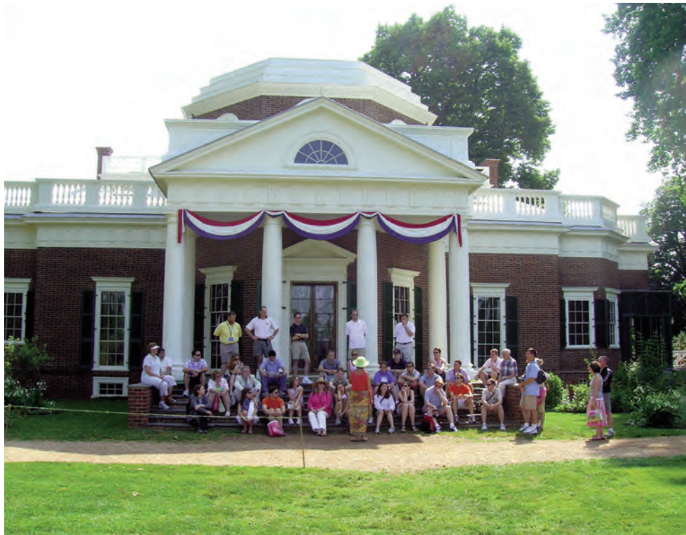
James Madison Fellows on a tour at Monticello.

Junior Fellowships are awarded to college seniors and graduates who wish to become secondary school teachers of American history, American government, or social studies for full-time graduate study toward a master's degree. Junior Fellows are eligible for a maxi-