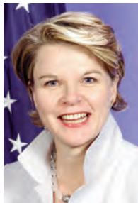
Margaret Spellings Secretary of Education Ex Officio