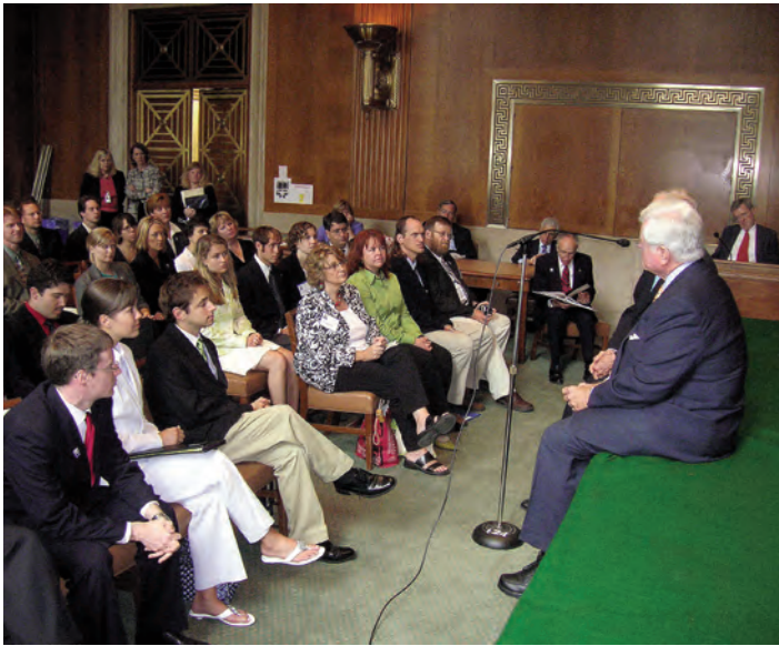
Senator Kennedy speaking to the Fellows.