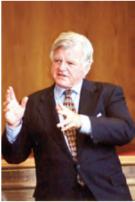
Edward M. Kennedy, Chairman, U. S. Senator, MA

The Foundation is governed by a Board of Trustees consisting of thirteen members. Twelve--two members of the Senate, two members of the House of Representatives, two members of the federal judiciary, one governor, two members of the general public and three members of the academic community--are appointed for six-year terms by the President of the United States. The Secretary of Education serves as an ex officio member. With the exception of the federal judges and the Secretary of Education, board membership is evenly divided between political parties.