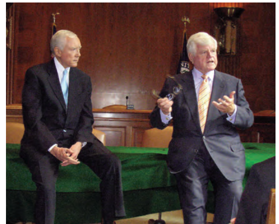
Senator Hatch and Senator Kennedy speaking to the Fellows.