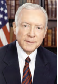
Orrin G. Hatch, Treasurer, U.S. Senator, UT