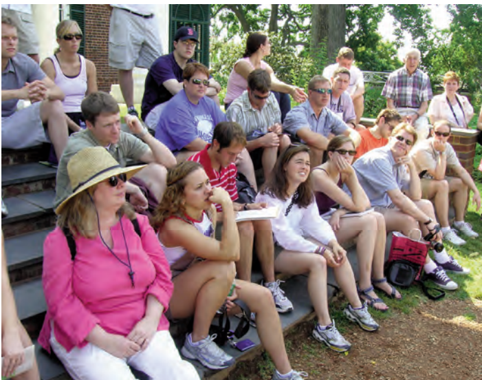
Fellows on tour at Monticello.

The 2005 Summer Institute on the Constitution was held from June 25, 2005 to July 22, 2005. A total of 52 James Madison Fellows, representing nearly every state, attended the Institute. An additional participant was a native of Havana, Cuba who is a school teacher in Florida.