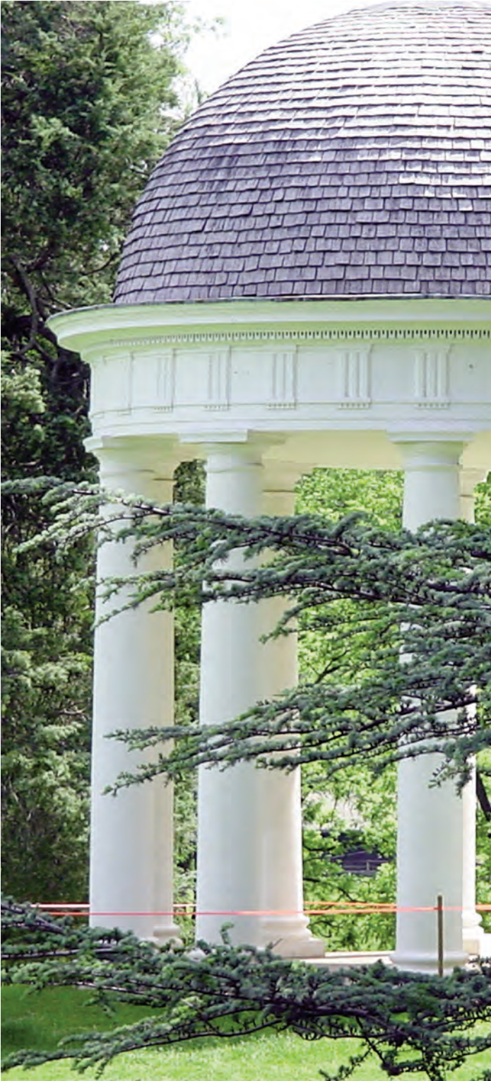
Garden temple at Monticello.