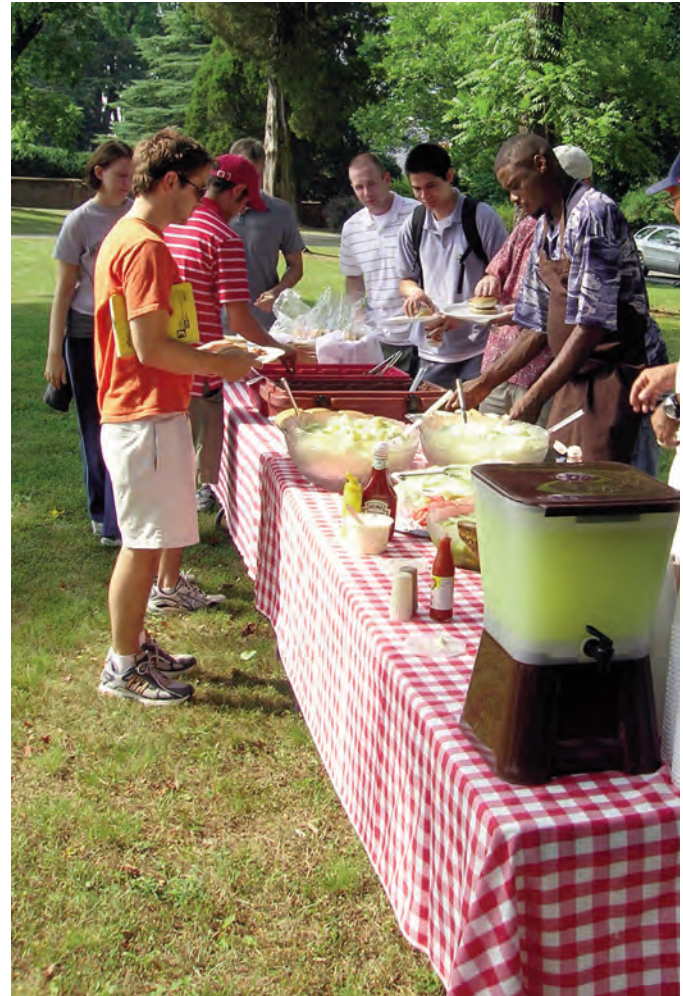
Picnic lunch for the Fellows at Montpelier.