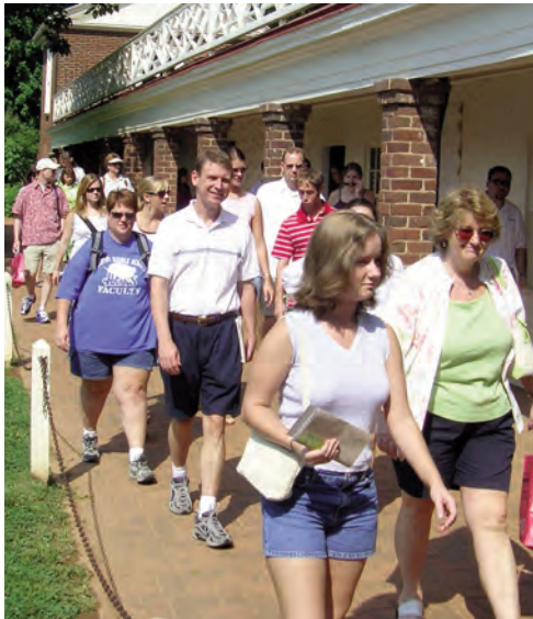
Fellows at Monticello.