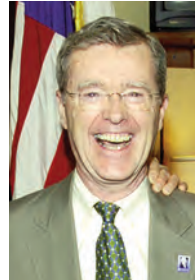
Diarmuid F. O'Scannlain, Judge, U.S. Court of Appeals, 9th Circuit