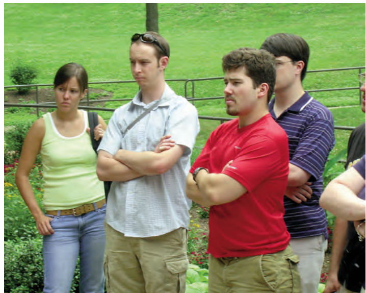
Fellows at Arlington Cemetery.