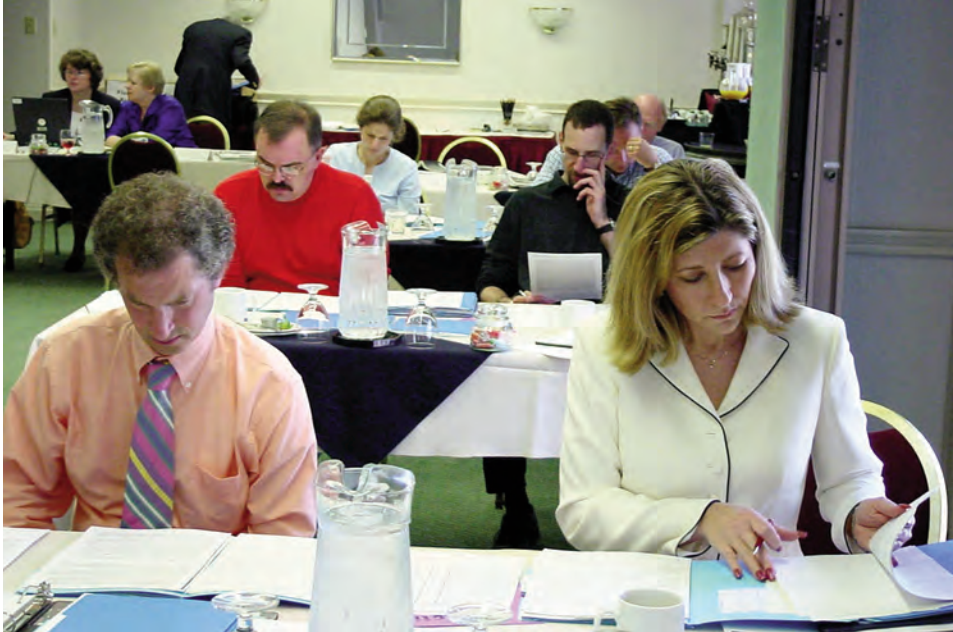
Fellowship Selection Committee reading applications