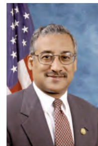
Robert Cortez Scott U.S. House of Representatives, VA