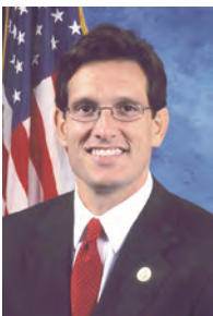
Eric Ivan Cantor, U.S. House of Representatives, VA