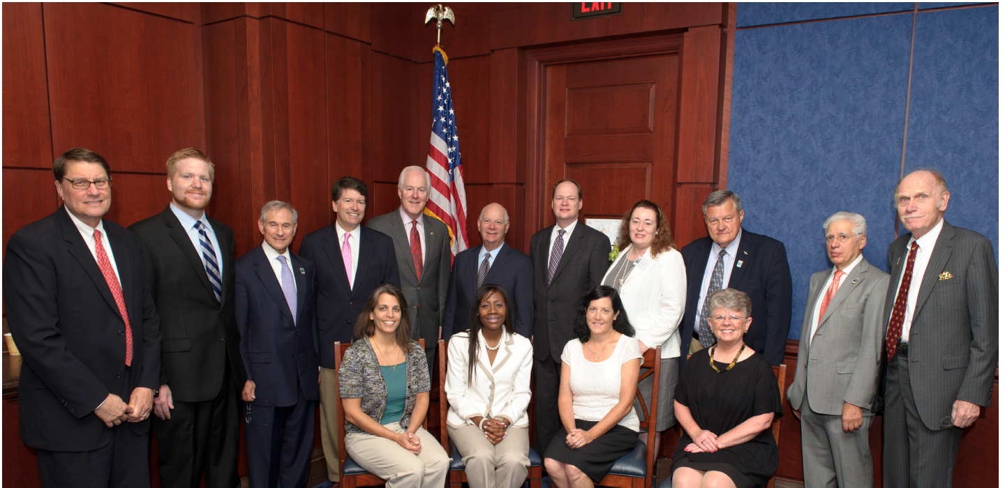
Foundation Board Members and staff gather at the annual Capitol Hill Board Meeting.