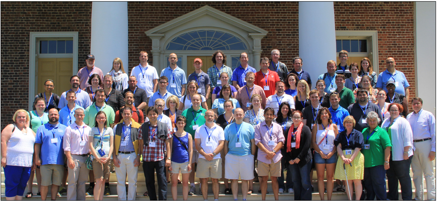
2013 visit of the James Madison Fellows to James Madison's Montpelier home in Orange, VA.