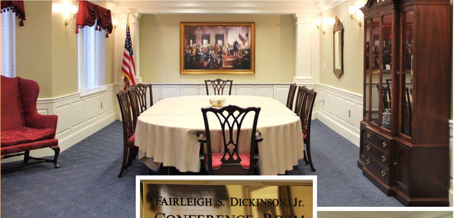
FAIRLEIGH S. DICKINSON, Jr. CONFERENCE ROOM

Since 1993, the Fairleigh S. Dickinson, Jr. Foundation has partnered with the James Madison Memorial Fellowship Foundation to annually support an additional fellowship for an outstanding New Jersey teacher. In 2001, the Foundation began its sponsorship of the attendance of at least one Cuban (or Cuban-American) citizen at the Summer Institute. Finally, in 2012, the Foundation made a generous gift to help complete and decorate the Madison Foundation's new conference room.