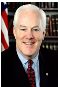
John Cornyn Chairman U.S. Senator, TX