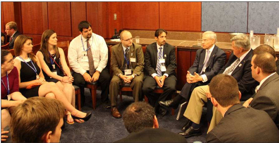
Foundation Board Members engage Fellows during informal discussion sessions held in conjunction with the annual Board meeting.

The Fellows were academically focused and worked hard during the 2013 Institute. The academic program continues to be rigorous and challenging for participants.