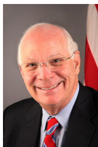
Benjamin L. Cardin U.S. Senator, MD