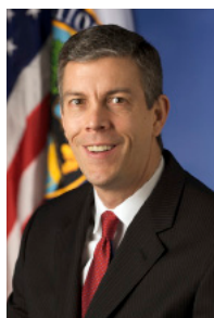
Arne Duncan Secretary of Education Ex Officio