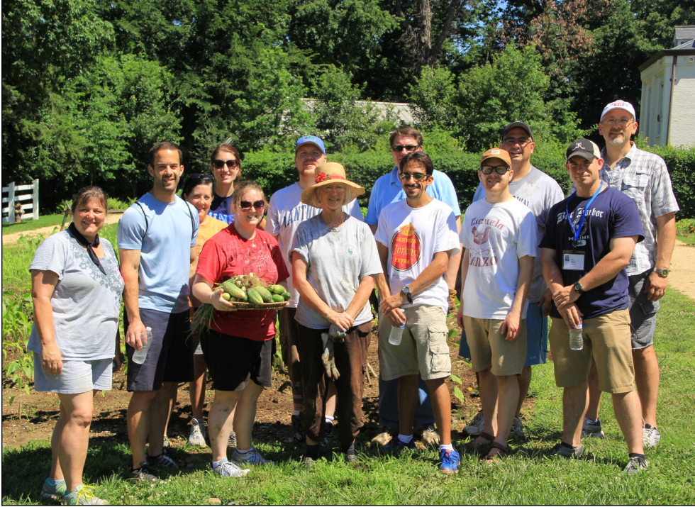
During the first Saturday Service option, Fellows and staff members clean out the gardens of the Custis-Lee Mansion in Arlington Cemetery.