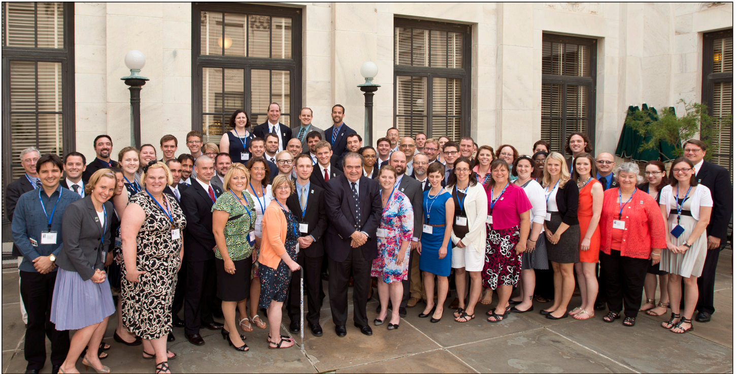
2013 Summer Institute Participants meet with Associate Supreme Court Justice Antonin Scalia.