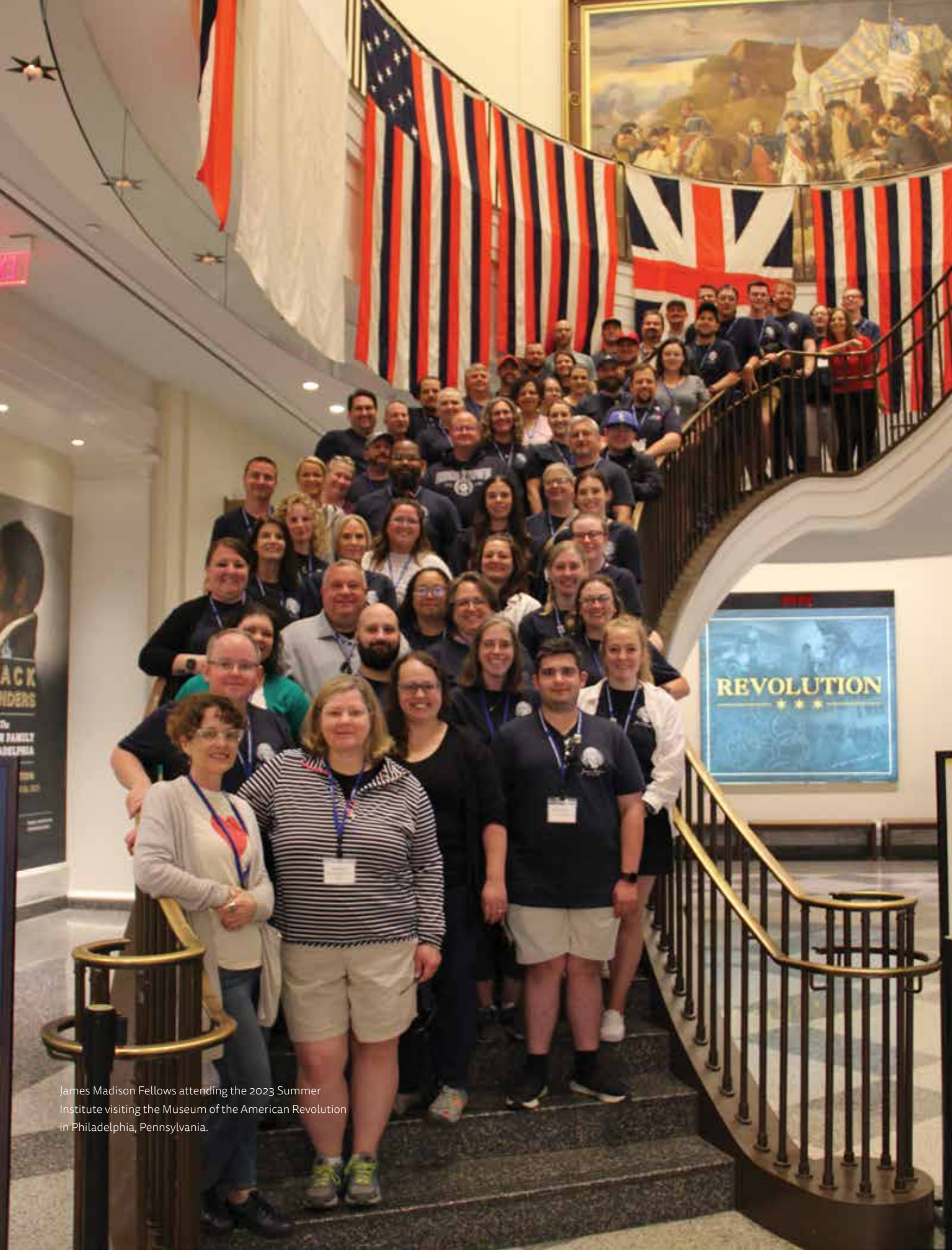
James Madison Fellows attending the 2023 Summer Institute visiting the Museum of the American Revolution in Philadelphia, Pennsylvania.