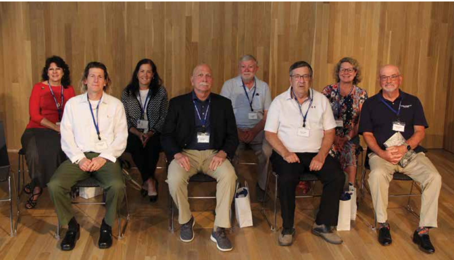
Class of '92 Fellows at the 2023 Summer Institute on the Constitution.